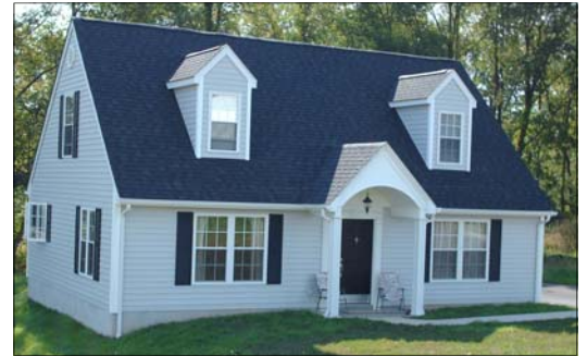
One of the newest homes in Deerfield Phase I.

The last two homes of Phase I are under construction, with planned completion dates of August or September. Please welcome the new residents at 210 Deerfield Lane and 115 Frederick Lane as they prepare to join the Deerfield community.